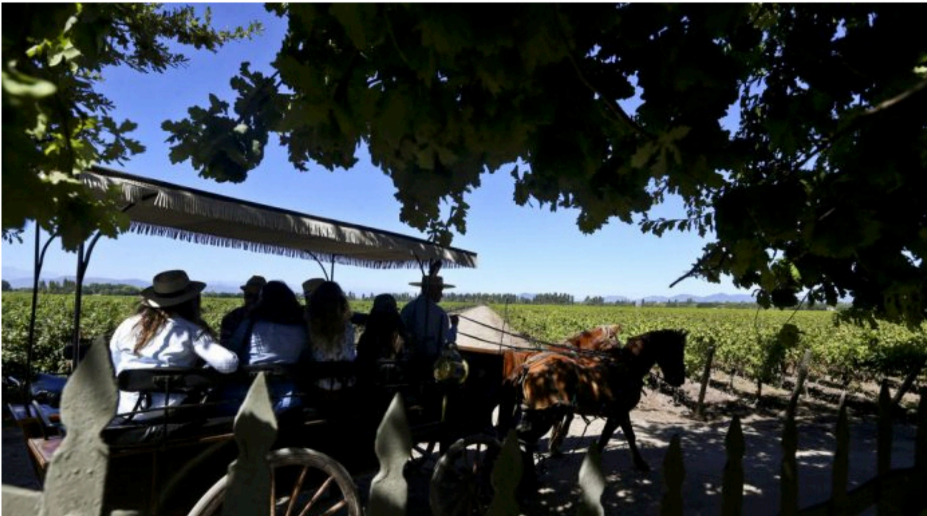
In this March 24, 2018 photo, tourists visit Viu Manent vineyard by horse-drawn carriage in Colchagua, Chile. The tourists have paid for a hands-on experience at Chile's harvest, which draws thousands of visitors each year.

VALLE DE COLCHAGUA, Chile (AP) — Dozens of tourists armed with sharp scissors and donning dusty gloves and aprons walk through rows of green vines, hand-picking dark purple grapes that will be turned into Chilean wines enjoyed around the world.