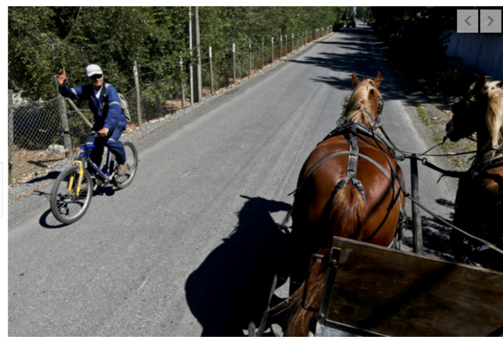
In this March 24, 2018 photo, a vineyard employee, who finished with his work day, waves to tourists visiting Manent vineyard on a horse-drawn carriage in Colchagua, Chile. The drive along the country's so-called Wine Trail gives tourists the chance to wine-hop at guesthouses and restaurants that offer the Carmenere, Cabernet Sauvignon and other varieties Chile is known for.

VALLE DE COLCHAGUA, Chile (AP) — Dozens of tourists armed with sharp scissors and donning dusty gloves and aprons walk through rows of green vines, hand-picking dark purple grapes that will be turned into Chilean wines enjoyed around the world.