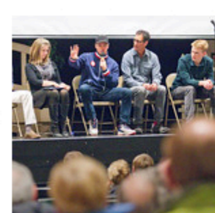
Week in Photos: March 18-24, 2018